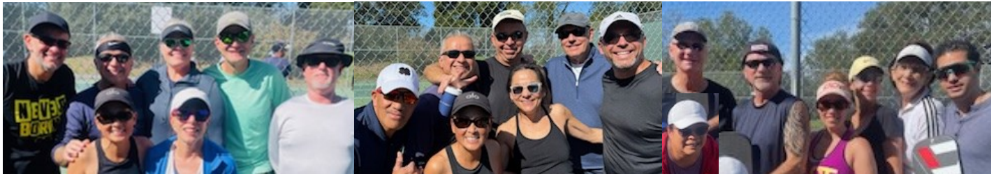
Some of our WCPC members looking pretty cool!

Many sports companies offer moderate to high-end priced eyewear. Around the Post recommends Gearbox Vision Eyewear ($40) for its slim fit and variety of colored lenses, and ONIX Eyewear ($35) with interchangeable colored lenses. If you can’t find something affordable, pull out a pair of safety goggles or punch out the lenses on an old pair of prescription glasses. For indoor play, get a pair of anti-reflective glasses to eliminate glare and make vision clearer - your eyes will thank you!